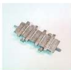
Dyma-certs™ 100 1002