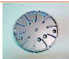
10" 20 segment crete mower 06 2000