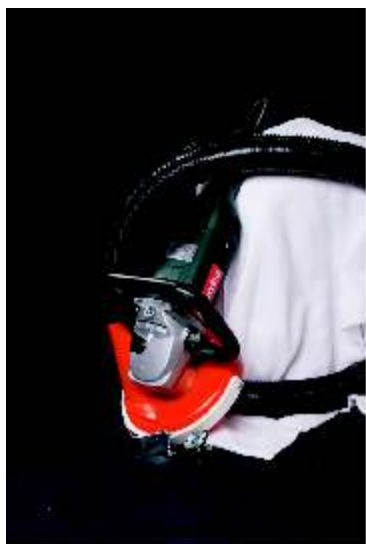
JD - 700GVC