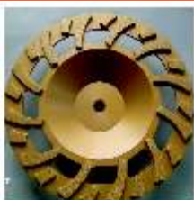
10" Super Turbo Cupwheel 5/8-11 Threaded 06 1858