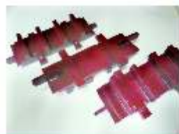
Quad Plate 100 1031