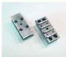
Diamond Product's version of the Dyma-cert 100 103