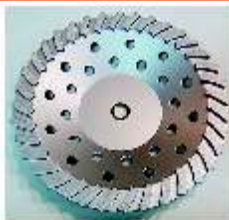
10" 36 Segment Turbo Cupwheel 5/8-11 Threaded 06 3657