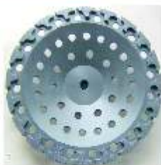
10" T-Segment Cupwheel 5/8-11 Threaded 06 T75