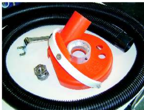
JD - 700KCU

For Vacuums please see pages 12 & 13 Cupwheels and Abrasive disks see pages 20, 22, 23